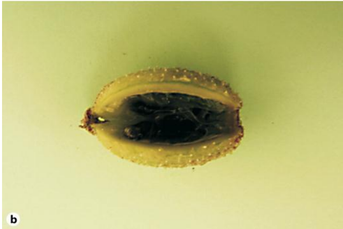
Fig. 1. Ecballium elaterium. a Fruit with its seeds. b Dissection of the fruit.